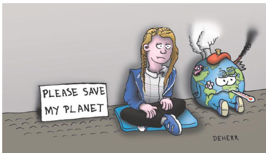
Greta Thunberg, inspirer of the strikes movement for the climate and current President of the United Nations Council